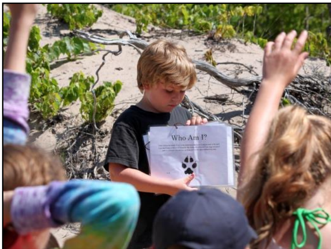
Campers explore the dunes